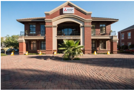
Picture 3: The South Africa FA Centre Satellite, established in cooperation with Adroit Technologies.