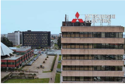
Picture 2: The new FA Center is located within the Italian Branch of Mitsubishi Electric Europe B.V.